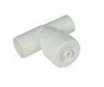
T493-A Universal Adapter