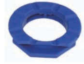
L039-2 Polygon Foot Pad