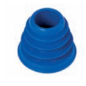
T493-15 Flow Regulator