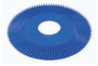
T493-4 Skirt Disk