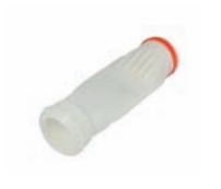
L058 Diaphragm with Clamp Ring