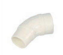
T494-3 Elbow Connector