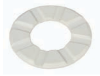
T493-5 Round Foot Pad