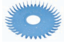
L039-3 Disk with Tentacles