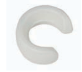
T702A-6 Float Ring