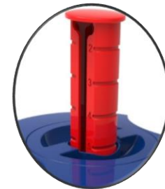
Balance of tablets