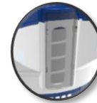
See through side