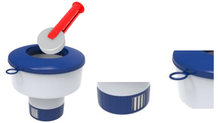
Add tablets Adjusting Control Handle ring