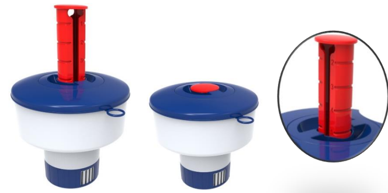
Full Empty Balance of tablets